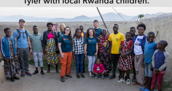
August 2023 | Big Puddle Films team and Impact Hope team filming in the refugee camp.